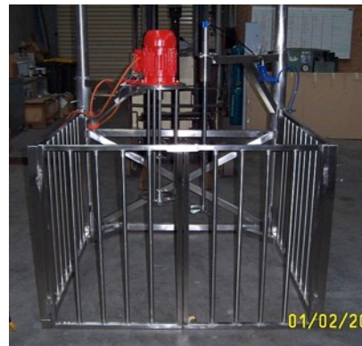
Mixer with pneumatic lifts and safety gate