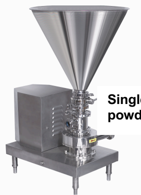
Single stage powder mixer

These systems can also be used for emulsifying of products or homogenising of products to a degree.