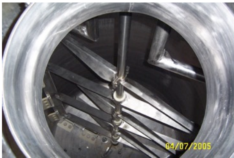
Counter Rotating Mixers