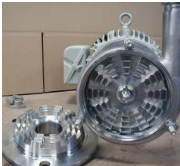
High Shear Mixing Pump