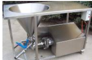
High Shear Powder Mixing System