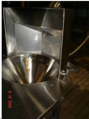
Optional Stainless steel Dust Extraction Hood.