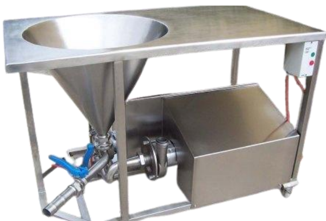
HIGH SHEAR POWDER MIXING SYSTEM