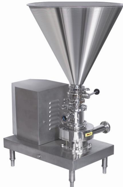
SINGLE STAGE POWDER MIXER