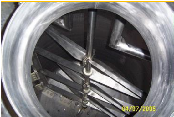
COUNTER ROTATING MIXERS