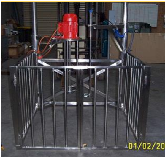
MIXER WITH PNEUMATIC LIFTS & SAFETY GATE