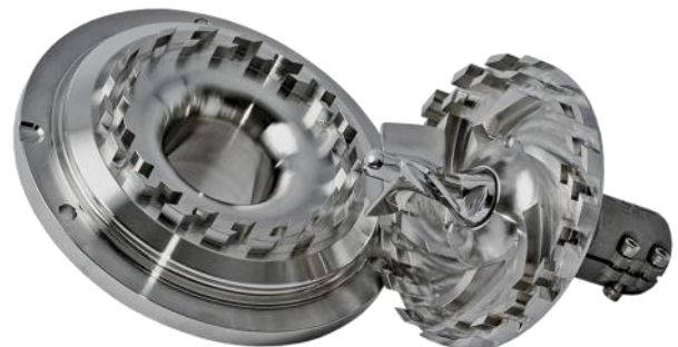
HIGH SHEAR MIXING PUMP