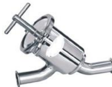
Y type filter

Filter is used to eliminate the small particulates from compressors, pumps, meters and some other equipment. When liquids flow through the screen, impurity can be held up. And then pure liquids come out through the outlet. When cleaning is needed, you just draw out the cartridge. And put it back after cleaning, it is a very convenient process. Such series filters are compact designs. Strong filter power. Small damage. Favorable price, they are mainly used in food, beverage, dairy and pharmacy industries.