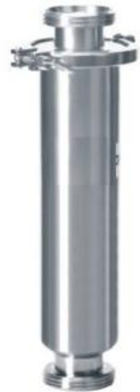
Straight type filter