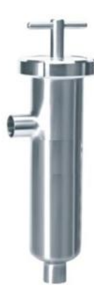
Angle type filter

Housing: AISI316L/AISI304 Gasket: EPDM according to FDA 177.2600 Inner polish: R_a < 0.8 \mu\text{m} Outside polish: mirror polish