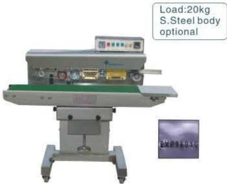
CBS-1100H With Ink Date Coder