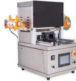
TP260 Table type tray sealer with gas filling