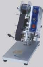
KY300A PRINT 3 LINES