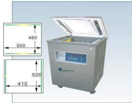
DZ/DZQ500 Vacuum Packer