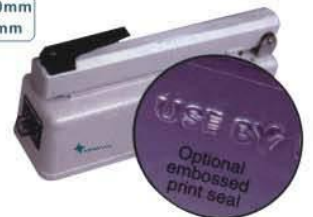
KS 200B/10mm with embossing date