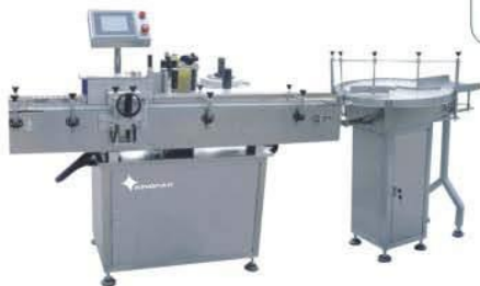
KTB-100AL Round Bottle

60-140bottle/hour Bottle Dia. φ20-120mm Label width: 25-90mm Label length: 15-80mm Label height: 30-150mm