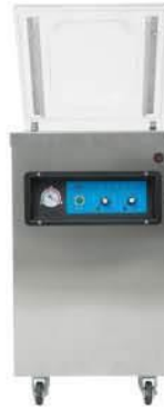
DZ400/2D Vacuum Packer DZQ400/2D Vacuum Gas Flush Packer