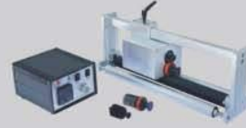
MS-1100 INK ROLL CODER