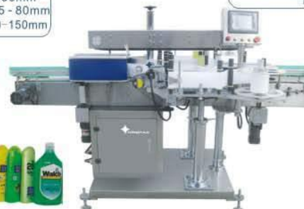
HTB-200A Double Side

150bottle/min Bottle Size: H: 300x(30-100mm) Label Size: W: 16-150mm L: 15-200mm