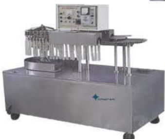
KBG200 Strip Ice Filling Sealing Machine 4000 Pcs/hour 50-200g/m