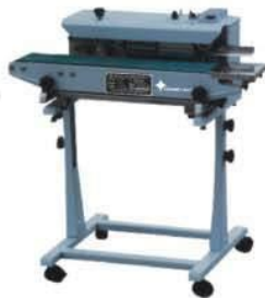
DBF-900LD With Embossing Date