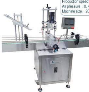
Linear Capping Machine

Power : 0.75kw Production speed: 30-60Piece /min Air pressure : 0. 4-0.6MPa Machine size : 2000x1400x1600mm