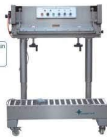
PFS-750A Pneumatic Impulse Sealer

sealing speed:0-12m/min sealing width:5-8mm Sealing length:750mm