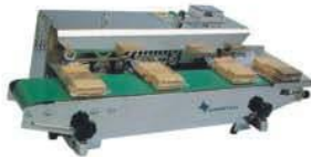
CBS900W S/S With Embossing Date