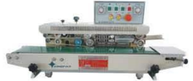
CBS-980P S/S With Ink Date Coder