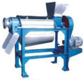
LZ-1.5 Type Spiral Juice Extractor