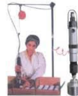
Electric capping machine

Cap Dia: & 15-40mm Capacity: 25Bottles/min Air Source: 0.02m 3 /min Air Pressure: 4-6kg/cm 2