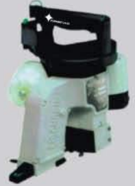
GK26-1 GK26-1AX BAG CLOSING MACHINE