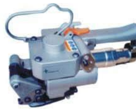
KP19E/25E 0.65mpa 19E: 9,13,16,19X0.6-1.0mm 25E: 16,19,25x0.6-1.2mm