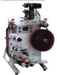
KPSL-130 Semi-auto Labeler