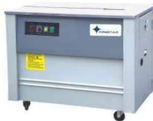
ST900 Table Type