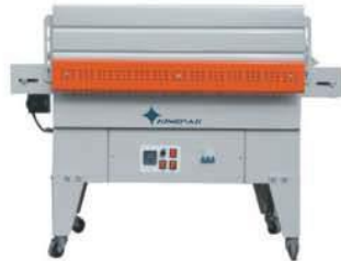
BS4525 Lower Recycle Wind Tunnel Height Adjustable