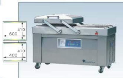
DZ400/2SB DZQ400/2SB DZ500/2SB DZQ500/2SB