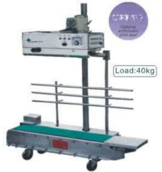
DBF-1300 s/s With Embossing Date