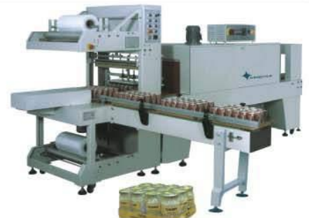
Full-auto ST-6030A+SM-6040 Packingsize: 600x300x300mm Speed: 8-20pcs/min