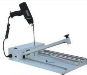
SHRINK A PACK SKA300/450/600 450W/530W/800W