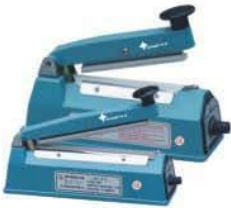
KS-100 4" KS-200 8"