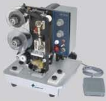
KY88A PRINT 3 LINES