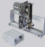
HP-241 Hot code-printing machine