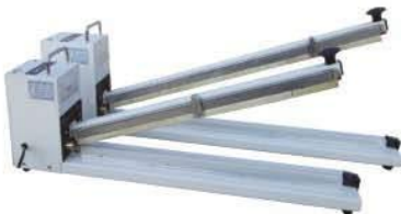
With Cutter 450HIC/600HIC/750HIC 900HIC/1000HIC