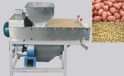
Peanut red skin peeling machine

SD-250 250kg/H. SD-500 500KG/H SD-750 700KG/H SD-1000 1000KG/H