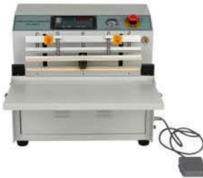
DZ400T External Vacuum Packager ( DZ400T:MS body; DZ400TS:SS body )