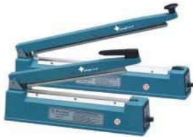
KS-300 12" KS-400 16" KS-500 20"