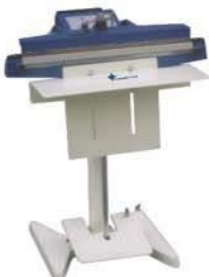
KS-F350/450/600/800 Big Table Optional