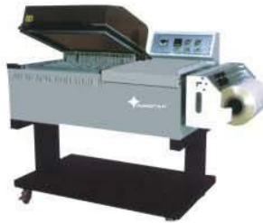
BFS-5540/BFS-5540A Chamber Size: 550x400 BFS-5540/5540A With conveyor Out