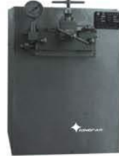
GJJhomogenizer pressure: 25Mpa-40Mpa Flow: 0.5T/h-10T/h