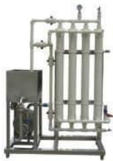
Hollow fiber filter filer 1ton-20tons