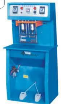
r-w-8U Electric Tube Sealer