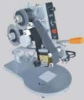
DY-8 PRINT 3 LINES