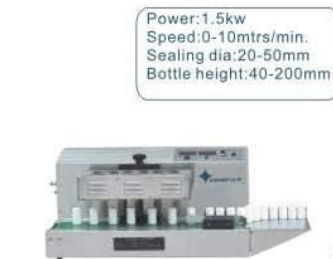
LGYF1500A-I Continuous Induction Sealer

Power: 1.5kw Speed: 0-10mtrs/min. Sealing dia: 20-50mm Bottle height: 40-200mm