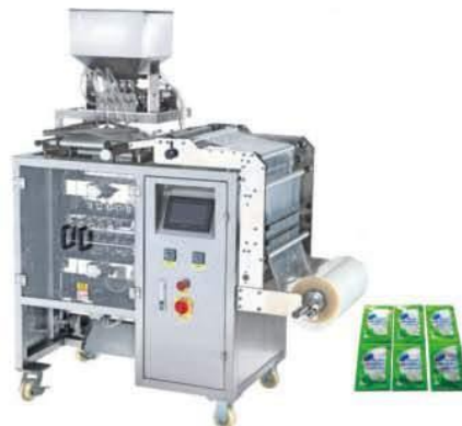
Multi-lane Packing machine for Liquid Film width:GH280,480,560,720,960mm