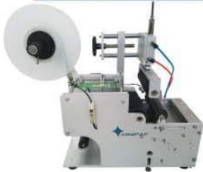
MT-80 Round Bottle labelling machine

Label size: 10-120x30-400Lmm Bottle Dia: 20-125mm