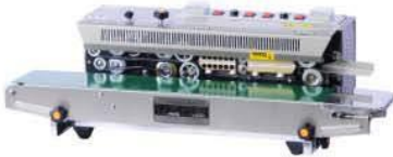
FRM980W s/s With Ink Date Coder