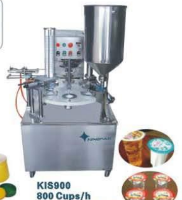
KIS900 800 Cups/h Auto-rotary Cup Filling Sealing Machine

Sealing diameter: \Phi 20mm- \Phi 130mm Bottles height: 40-400mm Transportation diameter: \leq \Phi 200mm Sealing speed: 2 to 12 m/min Conveyor unit bearing load: \leq 20Kg