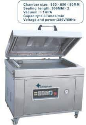
DZ-900 VACUUM PACKER

Chamber:1000x350x80mm Sealing Length:1000mm Capacity:3times/min