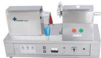
QDFM-125 Ultrasonic Tube Sealer

Sealing speed: 20sec. Seal Thickness: 70mm Heating power: 180W Power: 220W Sealing width: 55mm Sealing speed: 30Times/min Sealing material: Plastic Hose /Lead-Molded Hose