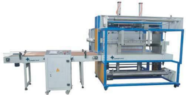
ST1260 Sheet / Board Shrink Packing Machine Coveyor :L4000mmxW650mm Packing size:1200x600x600mm Speed:6-10packs/min. Air source:4-8mpa