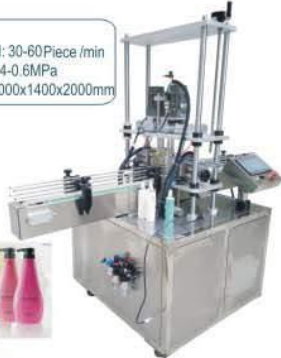
Linear Duckbill Capper