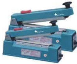
With middle Cutter KS-200C 8" KS-300C 12"