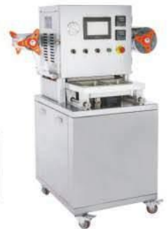
QDY2014 Automatic tray sealer (gas filling, 2cavity)