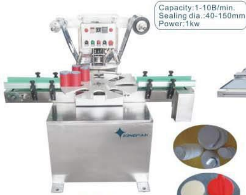
KIS-100 Rotating Jar sealing machine

Capacity: 1-10B/min. Sealing dia.: 40-150mm Power: 1kw