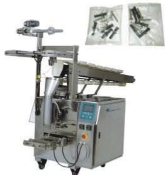
EPV-3220-PA Irregular Products Packing Machine