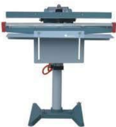
Pneumatic Pedal Sealer KS-FQ350/ FQ 450/ FQ 600/ FQ 800