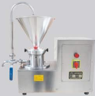
Peanut Butter Making Machine (Colloid Mill)