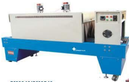
SM6040/SM6540 Tunnel Size: 1800/650X400mm 1500X600/400mm