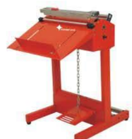
SF400C/SF600C With Cutter