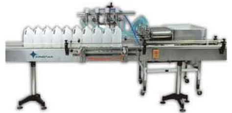
/PAST FILLING MACHINE HP-4S AUTOMATIC LIQUID Fill:25- 250ml, 50 500ml,100-1000ml Accuracy:±2 Filling speed :1200-4800 bottle/hour (4Heads)

Power : 0.75kw Production speed: 30-60Piece /min Air pressure : 0. 4-0.6MPa Machine size : 2000x1400x1600mm