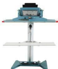
Vertical Sealing Head KS-F350FIT/450FIT/600FIT/800FIT