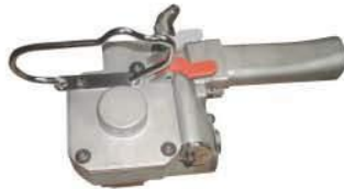
KS-19E/25E Pneumatic strapper Tape:PET