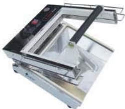
U SEALER 230mmx300mmx230mm