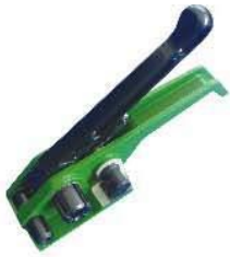
B311 Pet Tensioner