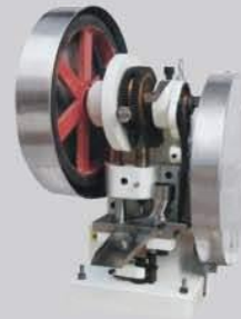
TDP - 6 Single punch tablet press