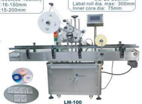
LM-100 Automatic Flat surface labeling machine

150bottle/min Bottle Size: H: 300x(30-100mm) Label Size: W: 16-150mm L: 15-200mm