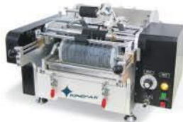
T811 Glue Labeling Machine