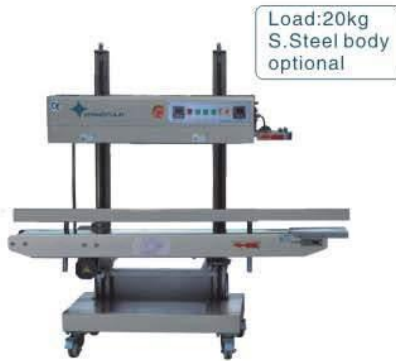
CBS-1100V With Ink Date Coder