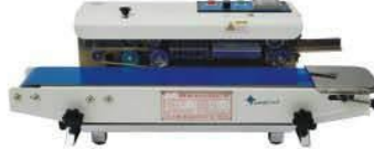
DBF-900W With Embossing Date