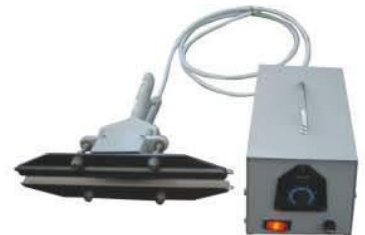
FKR200A/300A/400A HAND IMPULSE CRIMPER SEALER