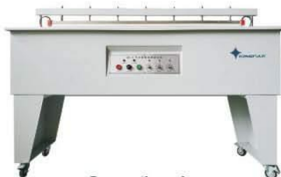
Pneumatic sealer HQD-A1000/1200/1400/1600/1800/2000