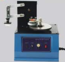
KY8080A KY8080B PAD PRINTER