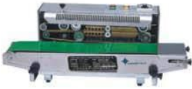
FR900W Continuous Band Sealer