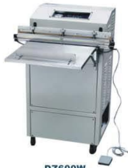
DZ600W External Vacuum Packager ( DZ600W:MS body; DZ600W/S:SS body )