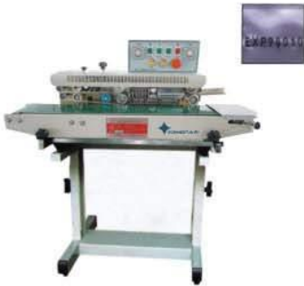
CBS980PLD With Ink Date Coder