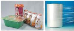
POF shrink film

heater power : 6.5KW conveyor speed : 0-10m/min tunnel size : 83 40 25cm