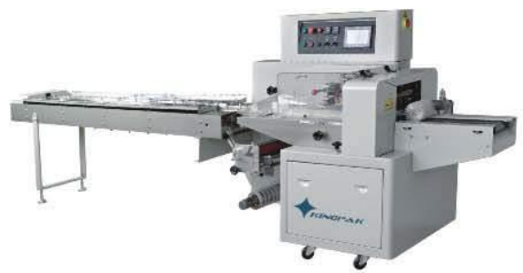
KHW250/350/450/600XD Rotary Down-film pillow Packing Machine