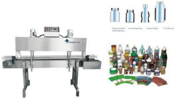
Shrink for bottle cap GP405 Bottle:400mmxφ100mm Tunnel size:830x100x100mm