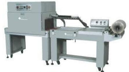
BSL2015 Shrink Tunnel With L-bar Sealer Packing size:500*400*250