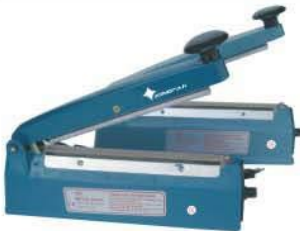
Iron Body • KS-200I • KS-300I • KS-400I Plastic Body • KS-100P • KS-200P • KS-300P • KS-400P