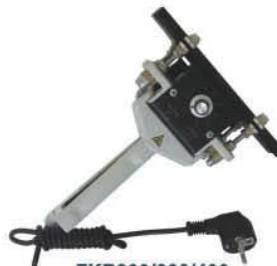
FKR200/300/400 HAND CONSTANT CRIMPER SEALER