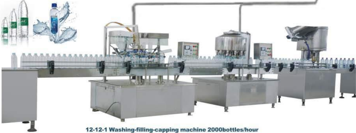
12-12-1 Washing-filling-capping machine 2000bottles/hour