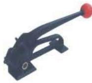
HB810 Steel Belt Strapper