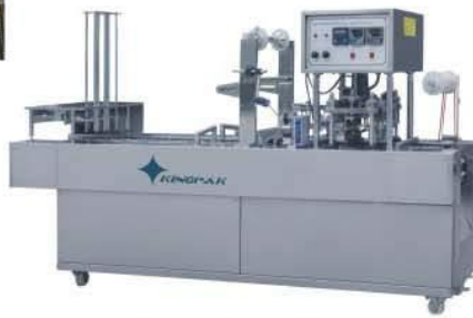
BG32A 960 Cups/h