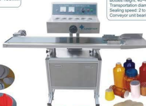
LGYF-2000BX Continuous Induction Sealer

Capacity: 1-10B/min. Sealing dia.: 40-150mm Power: 1kw