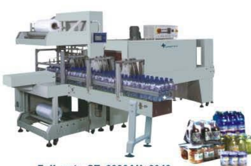
Full-auto ST-6030AH+6040 Packing Size: 600x300x300mm Speed: 8-18pcs/min