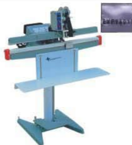
KS-F350/F450/F600/F800 With Coder