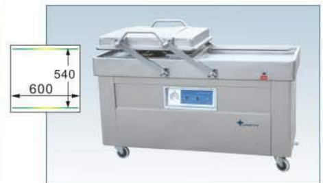
DZ600/2SB DZQ600/2SB-II DZ700/2SB DZQ700/2SB-II