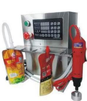
HP5000G with capping