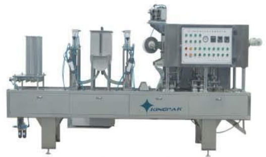
BG60A 3600 Cups/h