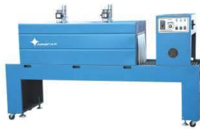
SM4530/SM4535 Tunnel Size:1500x450x300mm /1500x450x350mm