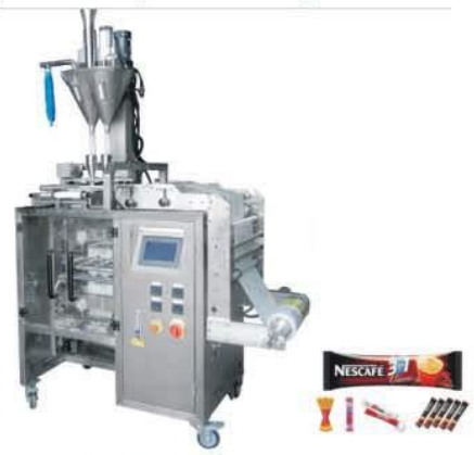
Multi-lane Packing machine for Powder Film width:GH280,480,560,720,960mm