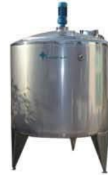
Fementation Tank 300L-10tons