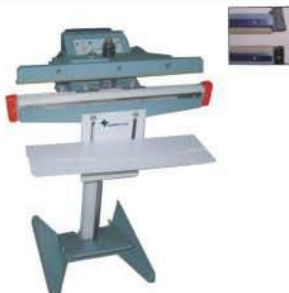
Double Heating Sealer KS-F350/450/600/800 x 2