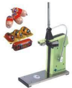
TD-711 Al.Wire Binder