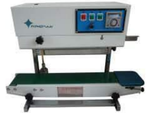
DBF-900LW With Embossing Date