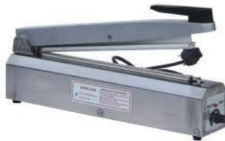
Stainless Steel Body SS-300