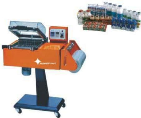
FM3028 2 In 1 Shrink Packing Machine Sealing size:300x280mm