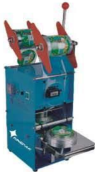
KIS-180/380 Manual Cup Sealer