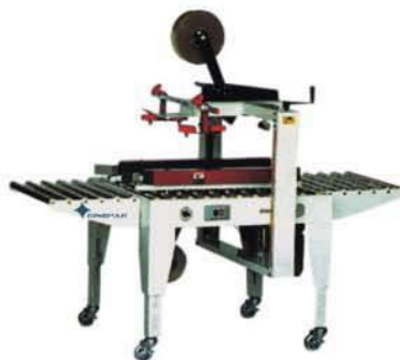
CS5050 (Side drive belts)