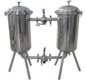
Double Filter 3,5,10tons

Label speed: 25-50pcs/min Label roll inner diameter: ≥ φ75mm max label roll out diameter: ≤ φ250mm Products size: 40-100mm Wide of label : W150XL180mm