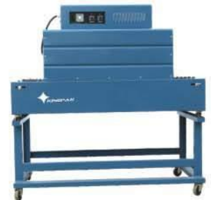
BS300/BSD400/BSD450 Tunnel size:300x150mm 800x400x200mm 800x450x250mm