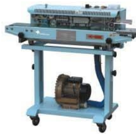
DBF-1000G With Embossing Date