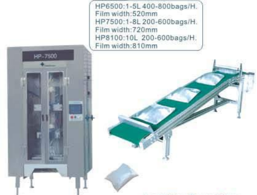
HP1000L-B Side Sealing

HP6500:1-5L 400-800bags/H. Film width:520mm HP7500:1-8L 200-600bags/H. Film width:720mm HP8100:10L 200-600bags/H. Film width:810mm