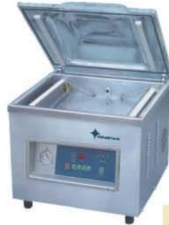
DZ400A Vacuum Packer DZQ400A Vacuum Gas Flush Packer