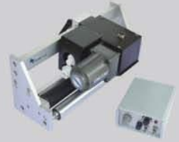
MS-200 MS-300 Fiction type code-printing machine