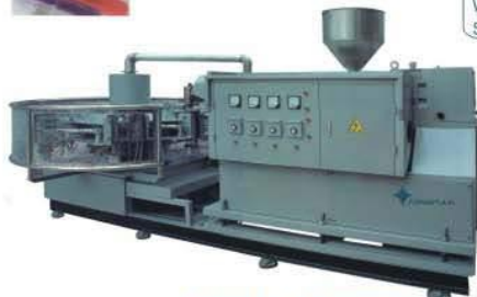
KPSC65-4 Automatic Pe Bottle Blowing Machine 2500 Bottle/h

Output Power: 1200W Operating frequency: 20KHz Sealing diameter: 5-80mm Working height: 0-300mm Sealing speed: 15 / sec