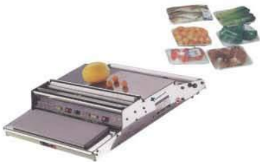
Hand Wrapper KW380/KW450/KW550