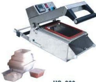
HS-300 Manual Cup Sealer

Speed 700-900trays/hour Power 0.35kw Sealing Area 190x145mm Tray size 95x140, 190x140mm Weight 6.5kg