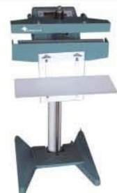
Direct Heat Sealer KS-DD300/400