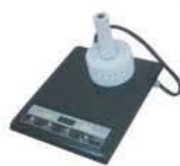
Induction Sealer KIS1068/KIS8068 \Phi 10-60/ \Phi 0-130mm 15 Bottles/min

Power: 1.5kw Speed: 0-10mtrs/min. Sealing dia: 20-50mm Bottle height: 40-200mm