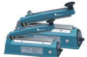
With Side Cutter KS-200C 8" KS-300C 12" KS-400C 16" KS-500C 20"