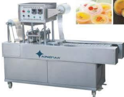
BG32 960 Cups/h