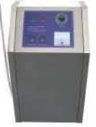
Ozone generator 3g, 6g, 10g, 12g, 20g, 30g