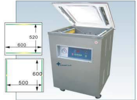
DZ/DZQ600 Vacuum Packer