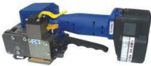
KT450 PP.PET: 16x0.64/16x1.05 Electric Friction Strapper