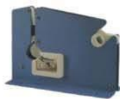
KT01 With Trimer