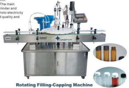
Rotating Filling-Capping Machine