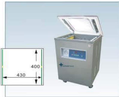
DZ400/2D Vacuum Packer DZQ400/2D Vacuum Gas Flush Packer