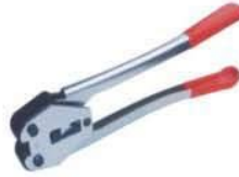
C306 PET Crimper