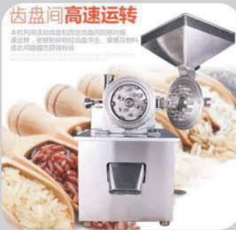
Powder Grinder stainless steel

Maximum compression force: 60kN Maximum tablet dia.: 25mm Maximum filling depth: 17mm Speed: 3000pcs/h Motor Power: 1.1kw Weight (kg) 148 Size: 760 × 360 × 690mm