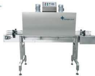
GP403 Tunnel Size: 105x400 Speed: 10m/min Shrink For Bottle Label