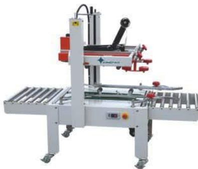
CS88 (Top&bottom drive belts)