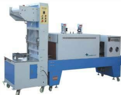
Sami-auto ST-6030+SM-6040 Packing Size: 600x300x300mm Speed: 8-12pcs/min