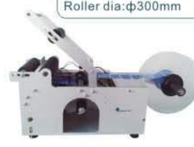
MT50 Semi-auto Round Bottle Labeling Machine