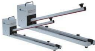
Portable Impulse Sealer 450HI/600HI/750HI 900HI/1 000HI