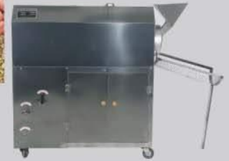
Roasting machine (Gas/heating)

SD-250 250kg/H. SD-500 500KG/H SD-750 700KG/H SD-1000 1000KG/H