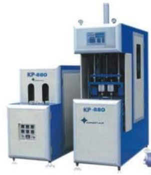
KP-880 Semi-auto Blowing Machine

HP1000L-I 250bags/h 200-500ml HP1000L-II 1600bags/h 500-1000ml