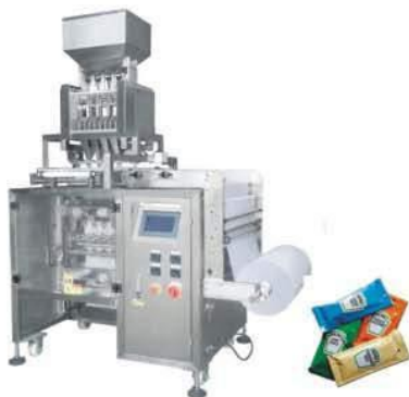
Multi-lane Packing machine for Grain Film width:GH280,480,560,720,960mm