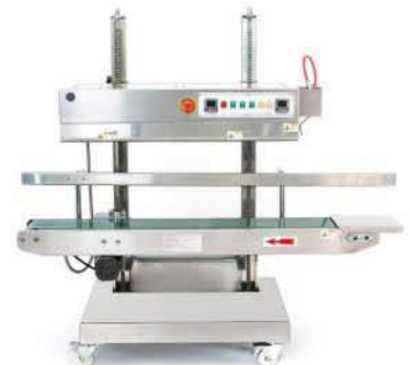
CBS1100V with vacuum/gas filling system