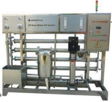
RO 1ton, 2tons, 3tons