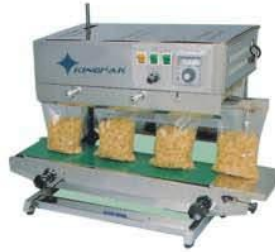
CBS-900LW s/s With Embossing Date