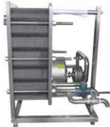
Heat exchanger 1m 2 -12m 2