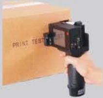
HAND-HELD JET PRINTER