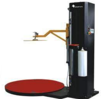
XT4502T With Top Press