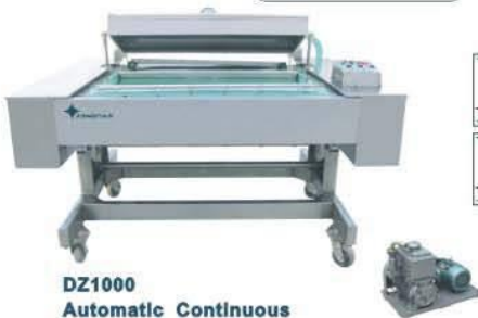
DZ1000 Automatic Continuous Vacuum Packer

Chamber:1000x350x80mm Sealing Length:1000mm Capacity:3times/min