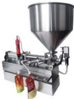
HP-B with capping