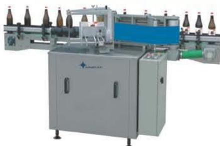
TN-120B Cold Glue Round Bottle Labeling Machine