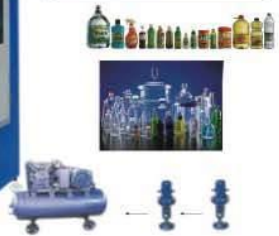
Low Pressure Air Filer Compressor

Capacity: 0.1-2.5L: 850B/h 3-6L: 400B/h Max Bottle Height: 360mm Max Bottle Dia: Φ180mm Area: 0.63m 2