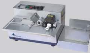
KY400ASS AUTOMATIC DATE CODER