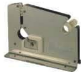
KT01C S/S Stainless Steel