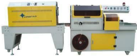
BSL-560A Automatic L-bar sealer Sealing Length:570×480mm Packing Height:125mm Max.Film size:530(w)×280mm Air compressor:0.5MPA

heater power : 6.5KW conveyor speed : 0-10m/min tunnel size : 83 40 25cm