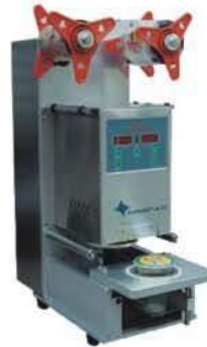
KIS-480 Stainless Steel Body Auto Cup Sealer