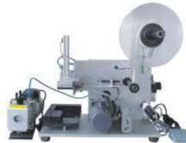
Mt60 Semi-auto Flat Surface Labeling Machine