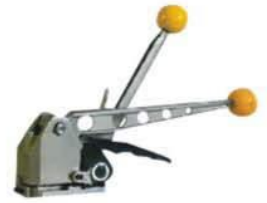
Seal Free Strapper SMK 25-13 13-15°0.4-0.4MM