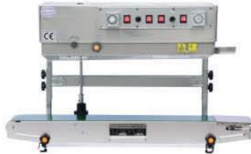
FRM980LW s/s With Ink Date Coder