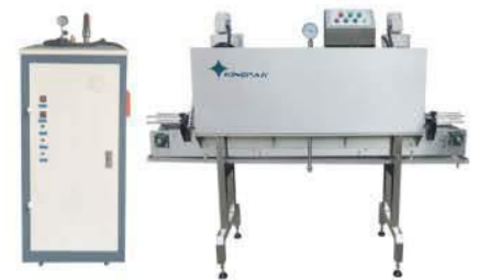
GP1500 Efficiency Steam Shrink Tunnel Tunnel size:1500X140X400mm