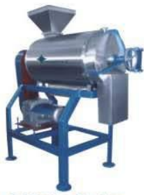
DJ Series Beater