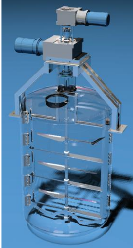
Counter Rotating Mixing System

STAINLESS STEEL FABRICATION, PROFESSIONAL ENGINEERS, FOOD AND PHARMACEUTICAL PROCESS SYSTEMS, HYGIENIC & ASEPTIC PUMPS, HEAT EXCHANGERS AND VALVES.